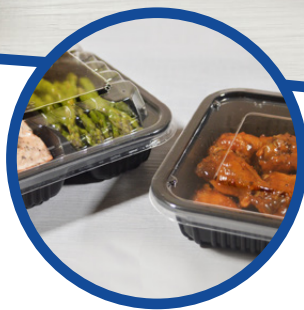
LID HEIGHT OPTIONS