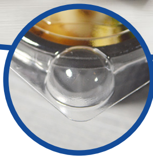
EASY-OPEN LARGE LIDS